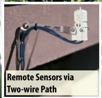
Remote Sensors via Two-wire Path