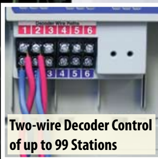
Two-wire Decoder Control of up to 99 Stations