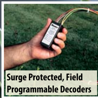
Surge Protected, Field Programmable Decoders