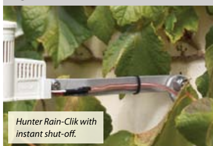
Hunter Rain-Clik with instant shut-off.

Each sensor may have its own alarm response pre-programmed, regardless of how it is connected!