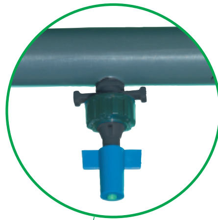
Schematic layout of PVC installation