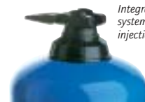
Integrated by-pass : system of turning concentrate injection on and off.

These options allow adapting your Dosatron to your needs. Contact our technical service to help determine what option you may need.