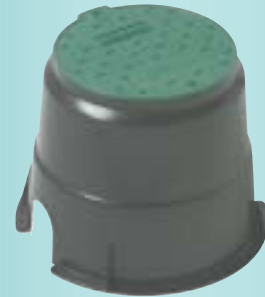
VBD06RND - Standard