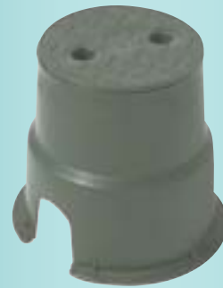
7316 - Deep