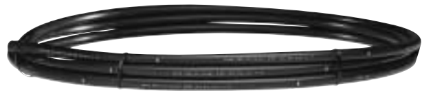
Super Funny Pipe

This unique piping acts like an extension cord, allowing you to put sprinklers exactly where you want them. Even deep-seated high-pops are easy to install in difficult, hard-to-trench locations.